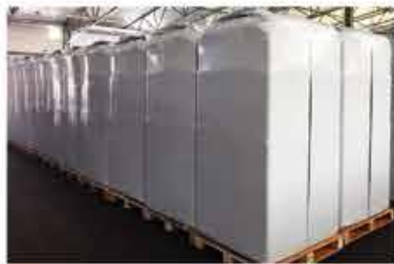
4 Bale is placed on a pallet and transported out